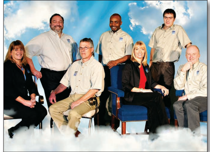
The Event Resources Team who makes you feel like you're on cloud nine.

Event Resources offers comprehensive event management and production solutions that leave lasting impressions. We provide behind-the-scenes logistical and technical support for a wide variety of events.