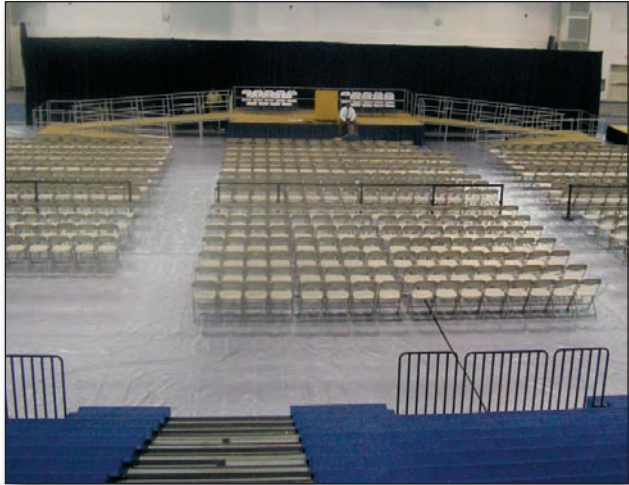
Hartford Public High School