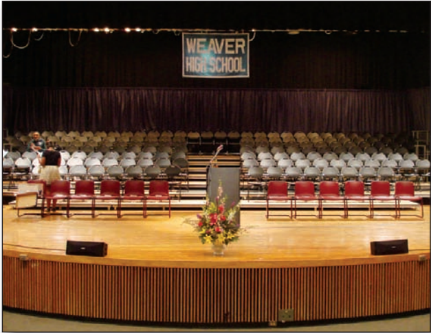
Weaver High School

In these pictures, seating risers were built on the stage so the graduating students could be seen by the audience.