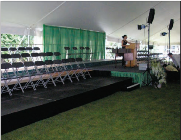
Miss Porter's School