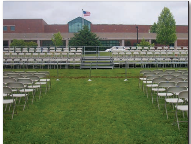
Lyman High School

In these pictures, seating risers were built on the stage so the graduating students could be seen by the audience.