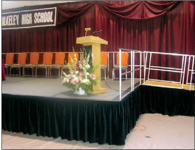
Bulkeley High School