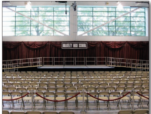
Bulkeley High School

Note that these stages also have handicap ramps to accommodate the individuals who need them. And don't forget about stanchions – they're great for crowd control and security.