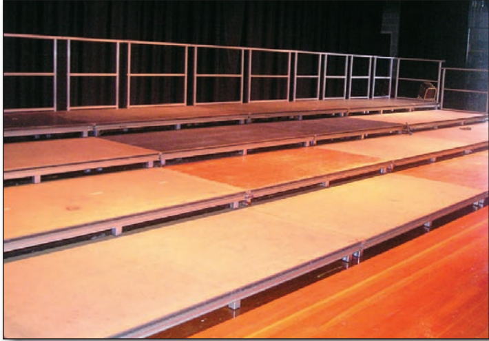
East Granby High School