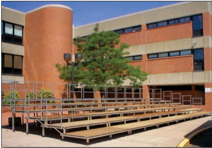
Rocky Hill High School

Graduation is an important day for a lot of people. You want to ensure everyone has a good view. With seating risers you can give both your audience and your students an unobstructed view.