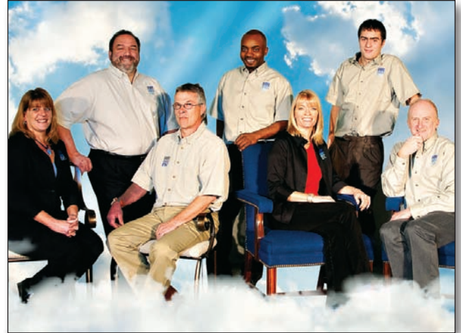
The Event Resources Team who makes you feel like you're on cloud nine.

Event Resources offers comprehensive event management and production solutions that leave lasting impressions. We provide behind-the-scenes logistical and technical support for a wide variety of events.