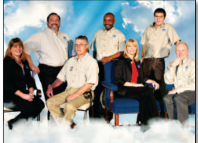
The Event Resources Team who makes you feel like you're on cloud nine.

Event Resources offers comprehensive event management and production solutions that leave lasting impressions. We provide behind-the-scenes logistical and technical support for a wide variety of events.